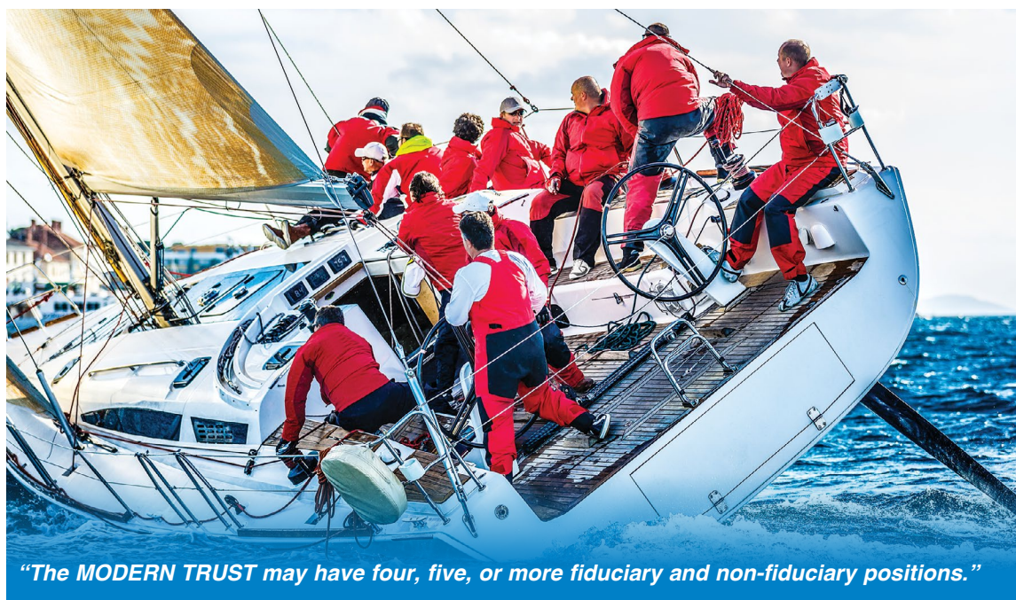
“The MODERN TRUST may have four, five, or more fiduciary and non-fiduciary positions.”

Recently there has been a trend toward dividing up these responsibilities, having a team of professionals working together. For example, if the trust will own a family business, the creator of the trust may want to entrust decisions about that business to a family member or business partner, one who has direct knowledge and relevant experience. When it comes to discretionary trust distributions, some may feel that family members should have a voice in the process. A trust may also employ a mechanism for granting someone other than the trustee the power to change the trust itself in response to unanticipated changing circumstances—such as changing tax laws, economic disruptions, or deteriorating global markets.